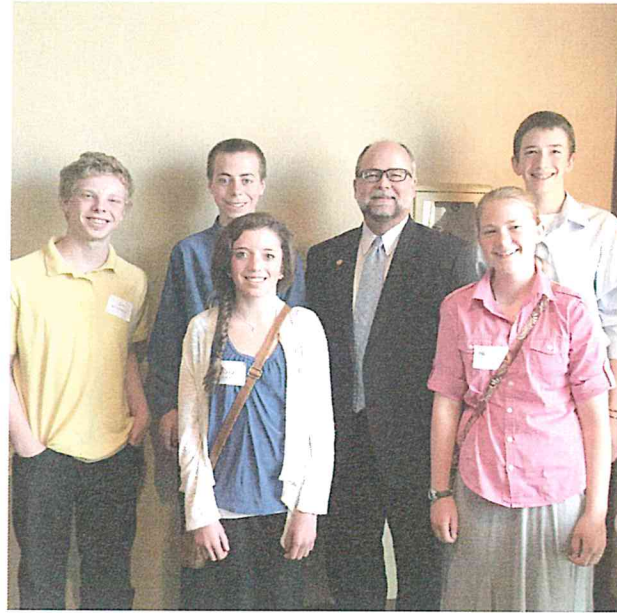
Students from TCRTL with Senate Majority Leader Arlan Meekhof at RLM's 2014 Legislative Day in Lansing