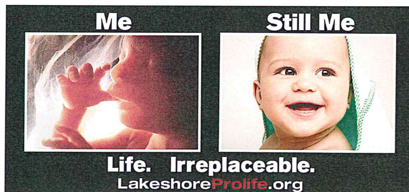
January Billboard campaigns promoting the sanctity of all human life raise awareness in the Tri-Cities area