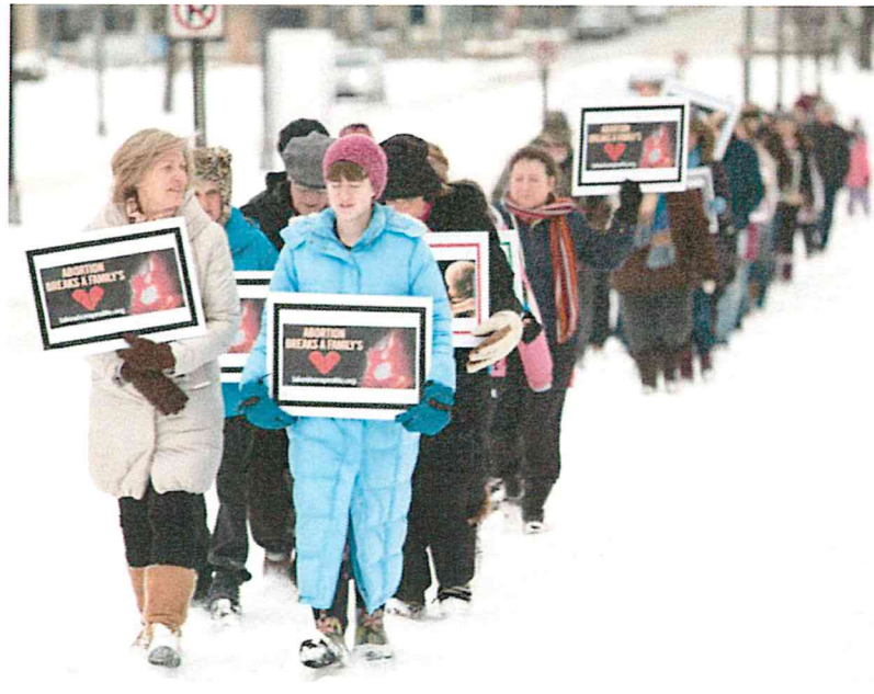
TCRTL members walking through the snow 2014 Memorial for the Unborn