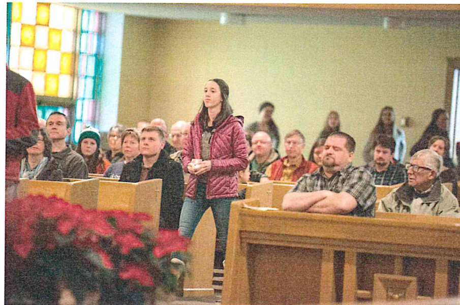
Candle procession during the annual Memorial for the Unborn in memory of unborn children lost to abortion from the Tri-Cities area