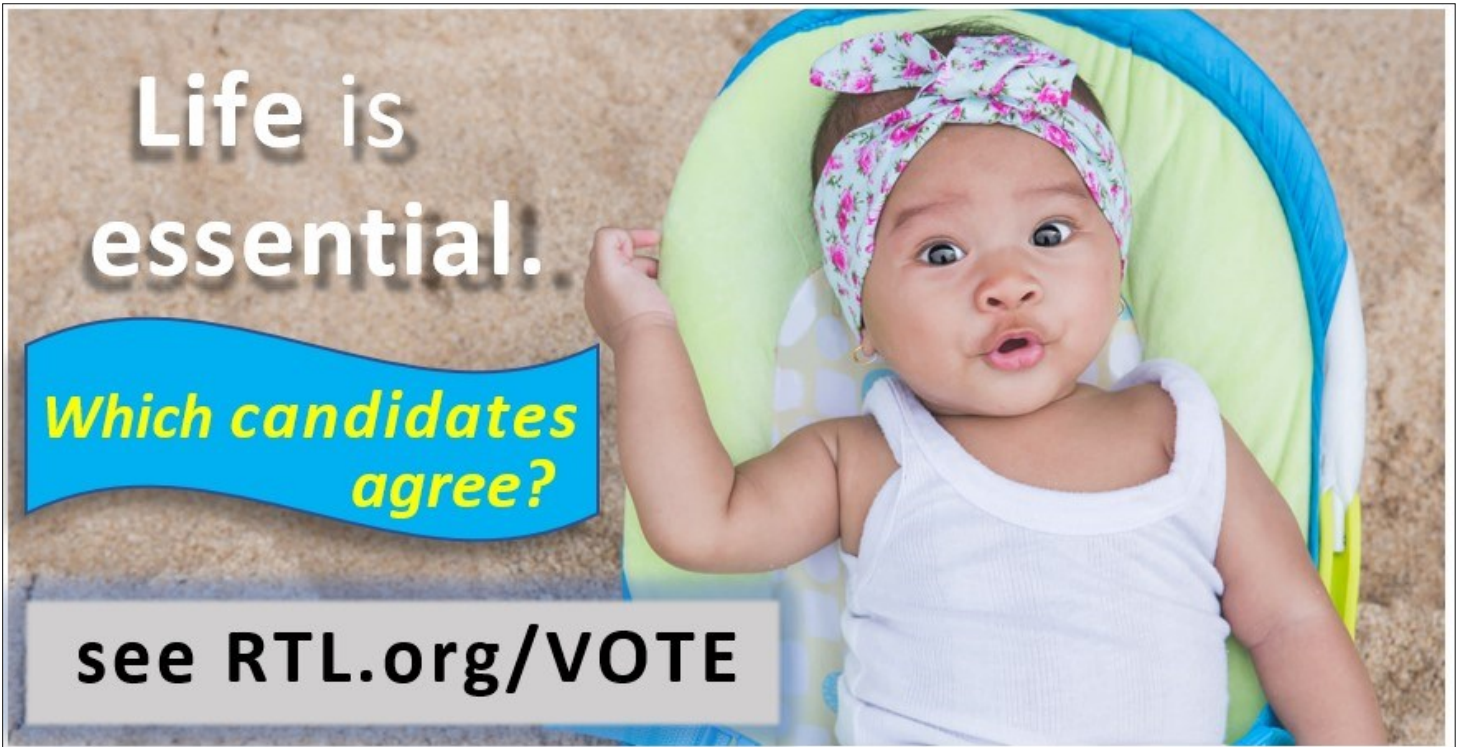
Above: Billboard designed by an ad committee of Tri-Cities Right to Life Board Members to kick off their Get Out The Vote effort.

GOTV sounds like a new television station, but it's actually an acronym you'll be hearing a lot in the next few months. GOTV = Get Out The Vote and in this crucial election year, that's precisely what we must do between now and the Nov. 3rd general election. There was no time to waste, so we started with a cute baby, coined a relevant phrase and pointed passersby to a link where they can generate a custom pro-life voting guide! It took our ad committee just three meetings— two virtual and one in-person, to arrive at the above results. Isn't it amazing what team work can accomplish?! This is one way your financial support becomes a literal, visible sign to the masses— in this case, providing