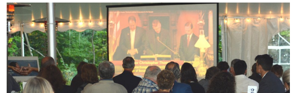
Above: Sept. 28, 2020—Watch Party attendees enjoy an outdoor, tent event, limited to one hundred this year.

As you can see in the above photos, our event not only went on as scheduled, it was enjoyed by all—with some even calling it ‘the best yet’. One reason for this may have been the outdoor setting amid color-tinted trees and freedom from masks. The cash bar this time was also a hit. But this year’s event seemed unique in every way. The Watch Party aspect, while adding a sizable technical challenge that left no room for mistakes, also allowed two notable figures to ‘join us’ via the big screen. Sarah Huckabee Sanders, former White House Press Secretary shared a very moving pro-life, pre-election message, and musical artist, Matthew West, theme song composer for the movie