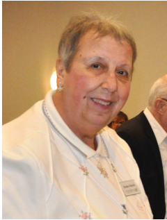
See story page 2

NON-PROFIT US POSTAGE PAID GRAND HAVEN, MI Permit No. 185