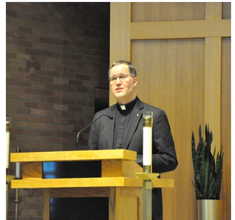
Above: Images from our Memorial for the Unborn event on January 23, 2021.

Here we are 48 years later. Roe v. Wade's grim anniversary snuck up on us again; and what can we say? I'm not sure. There are adjectives, like 'sad', though that doesn't go far enough. We've done so much to turn the tide—to prevent a pro-abortion administration from taking the reins and reigning with executive orders over U.S. international relations (Mexico City Policy), and who gets to use our tax dollars (Title X and the Hyde Amendment). Do you spend a lot of time thinking deeply about these things? We do. We must. January again brought Sanctity of Human Life Sunday (Jan. 17th this year) and a newly declared National Sanctity of Human Life Day on Jan. 22nd. Between those, on MLK day,