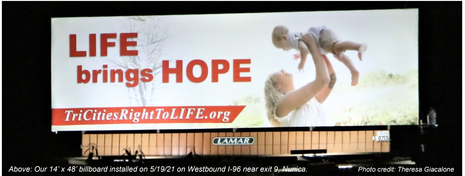
Above: Our 14' x 48' billboard installed on 5/19/21 on Westbound I-96 near exit 9, Nunica.