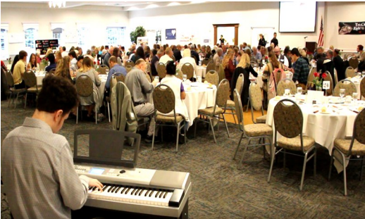
Find TCRTL videos at Rumble.com Search > Channel > TCRTL